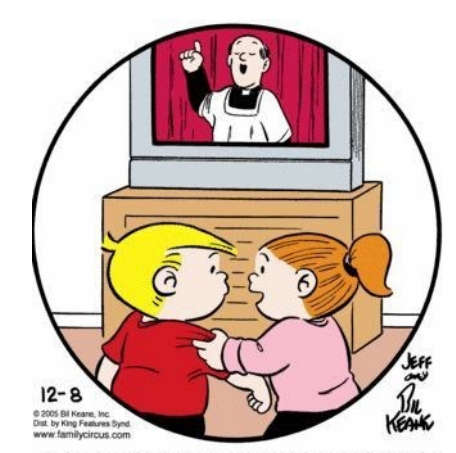
"Hear that? People in heaven have ever-laughing life."